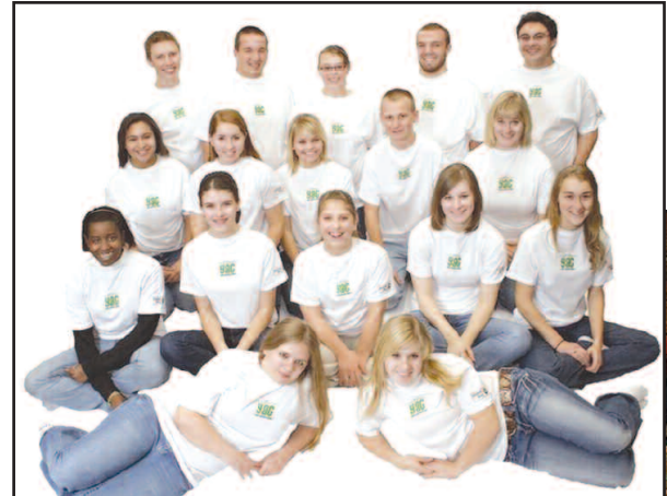
Youth Advisory Council (YAC) Board 2009-2010