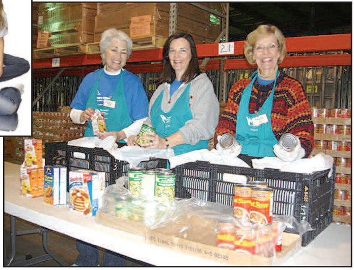
A grant received for the Back Pack program provides food to youngsters at school to take home